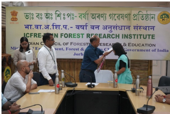
Felicitation of the invited guest by the Group Co-ordinator, ICFRE-RFRI, Jorhat.