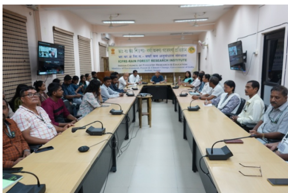
A part of the audience